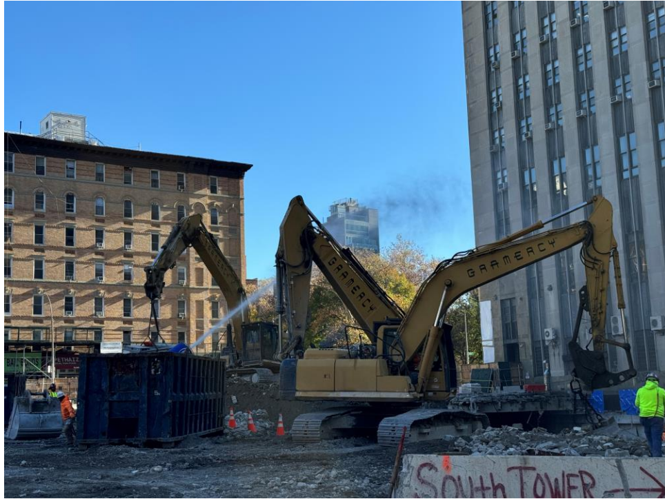
South Tower Dismantlement Progress (11/13/2024)