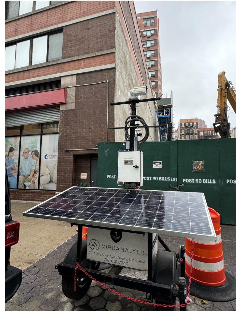
Air Quality/Noise Monitor on Centre St and Chung Pak (relocated on 7/31/2024)