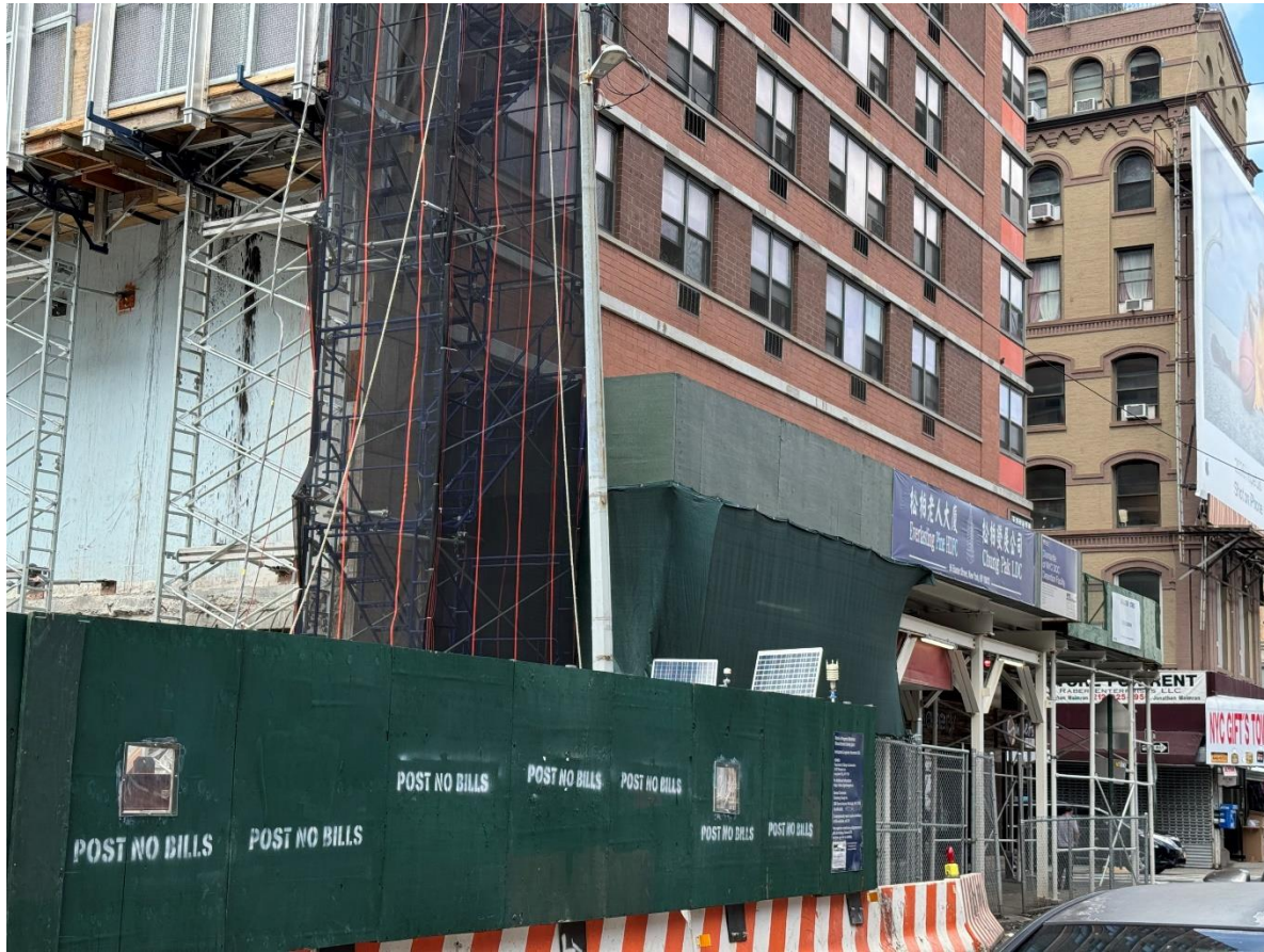
Air Quality Monitor/Noise on Baxter St and Chung Pak