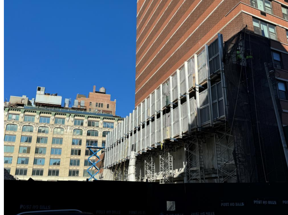
North Tower Gym Wall Scaffolding (11/12/2024)